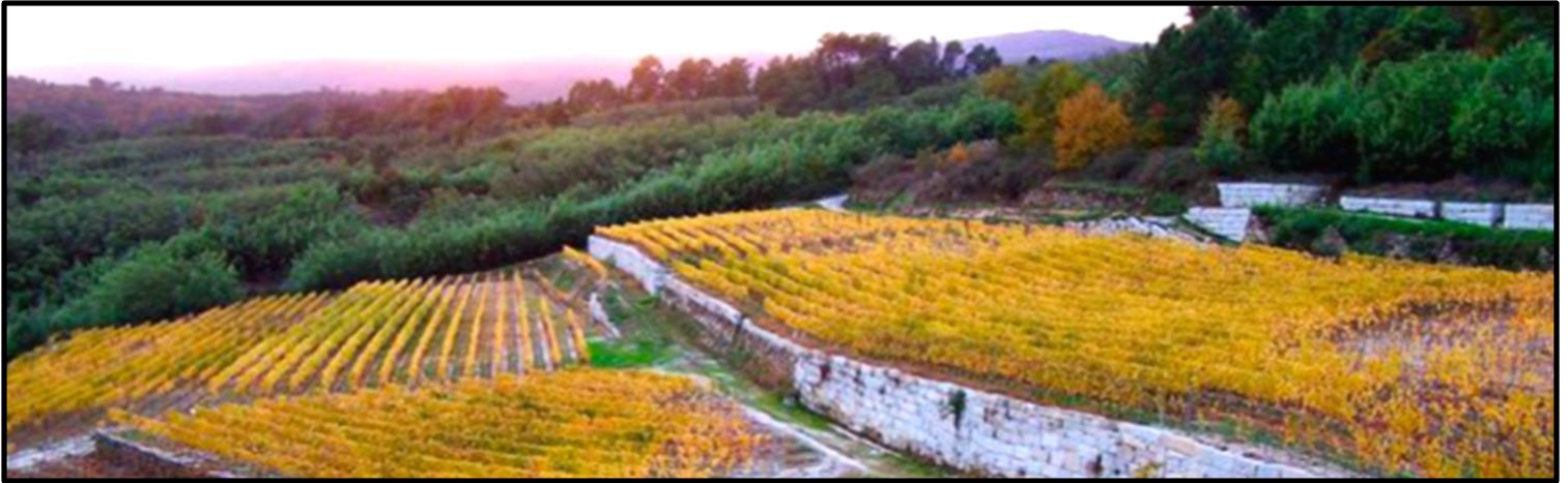
Casal de Armán Terraced Vineyards